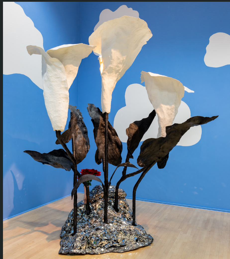
Arum Lily Record Player, 1970.